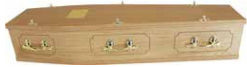
Rochester – Oak Veneer £520