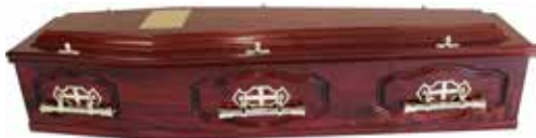
Windsor – Semi-Solid Mahogany (also available in Oak) £720