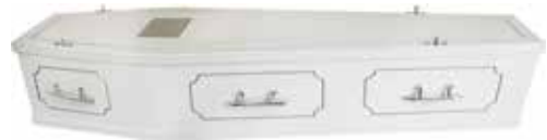
Oxford White – White Painted Veneer (also available in a range of colours - £720) £670