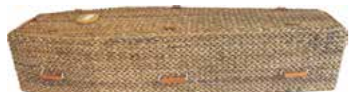
Banana Leaf – Coffin shape* (also available in Casket shape*) £995