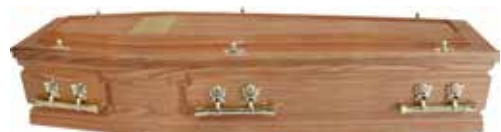
Westminster – Solid Oak (also available in Mahogany) £865