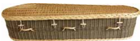
Personalised English Willow (Wicker) Hand-woven in Somerset, personalised to your specification £1,120