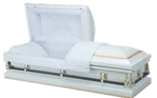
American-Style Caskets* American-style Caskets are available in wood or metal in a wide selection of designs From £1,470