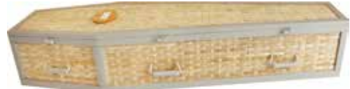
Premium Bamboo* £720